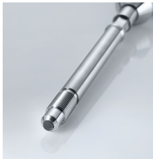
[Excalibur HD Extruder Probe]

The tec5USA UV-Vis Spectrometer has a modular design making it highly flexible and offering the possibility of customization to the particular needs of a given reaction. Essential for PAT, it has no moving parts making it a maintenance-free device, reducing operating costs and production losses associated with regular maintenance downtime.