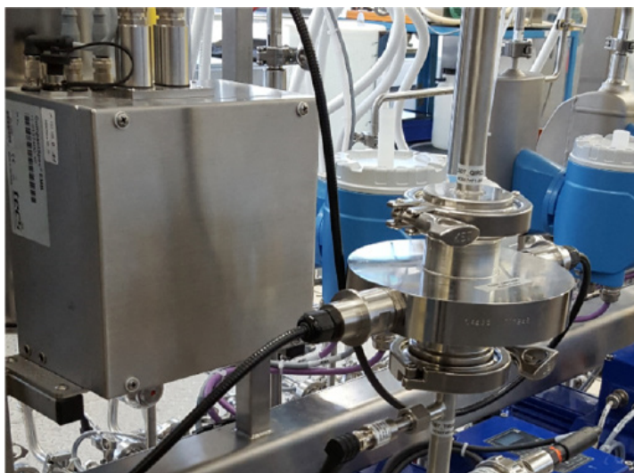
[tec5USA Online UV-Vis Analyzer]

With the tec5USA UV-Vis Spectrometer, the spectral acquisition times are short enough so that samples can be taken of the reaction mixture as frequently as every few milliseconds. This means that, should unwanted auto-polymerization occur, or other rapid reactions, the real-time concentration information can be used to adjust and optimize the process as necessary.