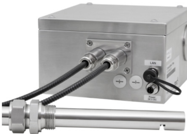
[tec5USA CNIRS in a stainless-steel enclosure]

The Compact UV-NIR Spectrometer is an extended-range UV/visible/IR spectrometer for measuring wavelengths in the 300 – 1100nm range. The system offers a wavelength accuracy of less than 0.3nm and is permanently wavelength calibrated to ensure reliably accurate measurements.